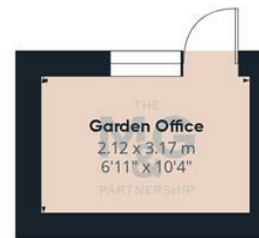
Floor 0 Building 3

Please Note: These details have been carefully prepared in accordance with the Sellers instructions, however their accuracy is not guaranteed. Measurements are approximate and where floor plans have been included, they serve purely as a guide to general layout and should not be used for any other purpose. The photographs displayed are also for promotional purposes only, and do not indicate the availability to purchase any of the fixtures and fittings. We have not tested any services or appliances, and potential purchasers should make their own enquiries to ensure that they are of a satisfactory working standard. Important: No person in the employment of Mortimer & Gausden Limited has any authority or ability to make or give warranty or representation whatsoever in relation to this property. If you are in any doubt as to the correctness of any of the content contained in either these details, our advertising or website, please contact our offices immediately.